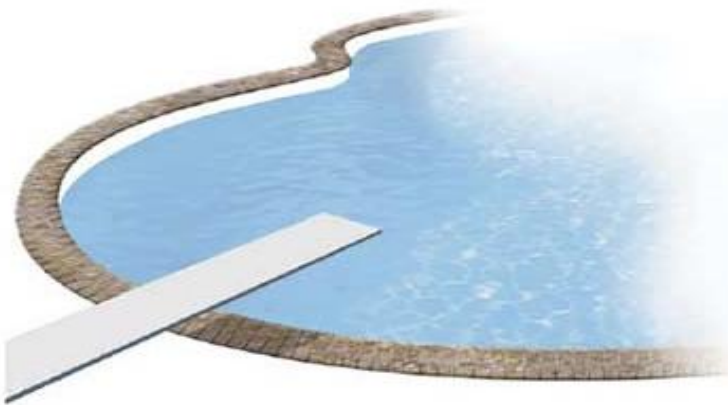
Bullnose coping, pool application

Can be used for pool coping or step coping during new applications and replacement applications. (Not for overlay applications.)