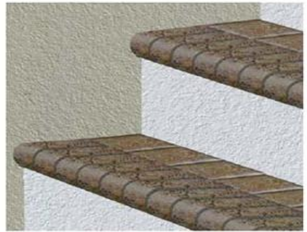
Bullnose coping, step application