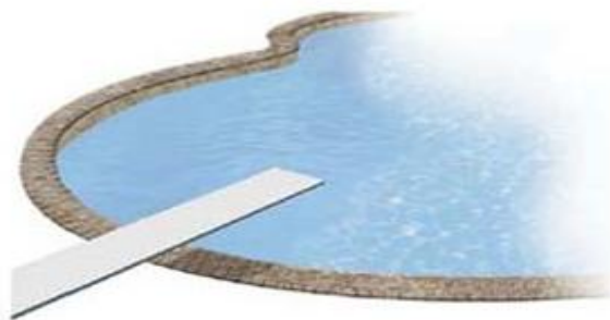
Remodel coping, pool application