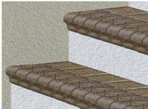
Remodel coping, step application

Can be used for pool coping or step coping to overlay existing hard surfaces.