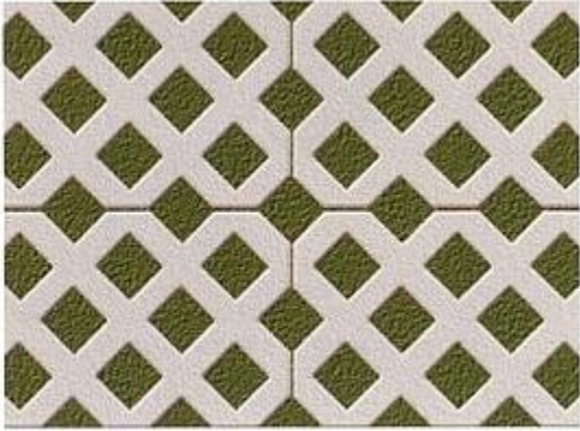
90° Straight Stack